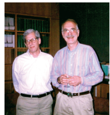
Figure 3 With Philip W. Majerus, 1995.

Stuart lives and breathes science and has made major contributions to several fields including cell biology, glycobiology, and genetic diseases. With many great scientists, you can summarize their major achievements in a few short phrases or iconic images. And so it is with Stuart (see Figure 5). When I joined the lab in 1979, he had just published a classic series of papers working out the entire pathway for N-linked glycan chain processing (4), a scientific, technical, and intellectual tour de force that has since had a huge impact in many fields, basic and applied. Bucking the classic trend in showing detailed chemical structures, Stuart decided to summarize the findings using simple symbols to represent individual monosaccharides that made up the glycan chains (Figure 5, left panel). His idea caught on, and three decades later, this concept has expanded into a system of symbol nomenclature for monosaccharides that some of us updated in the primary textbook in the field (5) and is now used throughout the world (three of the eight editors are Kornfeld trainees). I was also fortunate to be in Stuart's lab and involved in his second classic set of studies, which eventually elucidated the entire mannose 6-phosphate pathway (refs. 6, 7, and Figure 5, right panel), by which newly synthesized lysosomal enzymes are selectively phosphorylated by a very novel mechanism and then specifically targeted