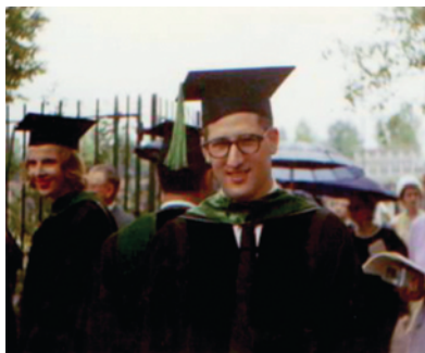
Figure 1 Graduation from Washington University School of Medicine, 1962.