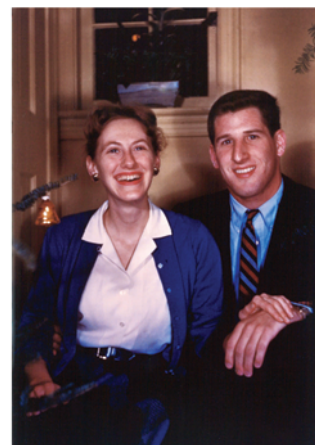
Figure 2 Wedding day in Bethesda, June, 1959.