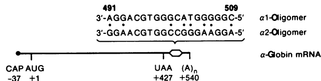
Figure 3. \alpha 1 - and \alpha 2 -globin oligomers. The base sequences and positions of the \alpha 1 - and \alpha 2 -globin oligomers are shown relative to \alpha -globin mRNA. The positions of the 5'-terminal cap structure (CAP), initiation codon (AUG), termination codon (UAA), and 3'-polyadenylate tail ((A) n ) of \alpha -globin mRNA are shown. The position +1 refers to the A of the AUG initiation codon. The region of divergence of the \alpha 1 - and \alpha 2 -globin mRNAs within the 3'-nontranslated region is indicated by the open hexagon. Dots between the sequences of the two oligomers indicate positions of sequence mismatch.

E, reveal that \beta -globin mRNA is distributed on larger polysomes than \alpha -globin mRNA.